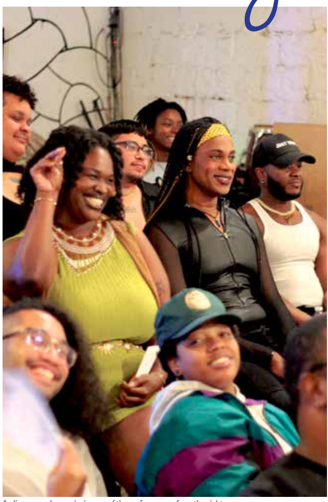
Audience members enjoying one of the performances from the night