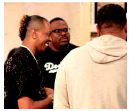
Audience members mingling with poet ANON The Griot.

To stay informed about upcoming Exchange events and other South Fulton Arts initiatives, be sure to visit SOUTHFULTONARTS.ORG