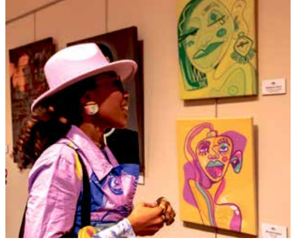
An art lover at the show

Union City and South Fulton Arts anticipate an extraordinary talent showcase at The Creative Exchange: K-12 Student Art Show, reinforcing the City's commitment to fostering creativity and celebrating the arts in the community.